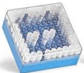
10x10 PC Cryobox