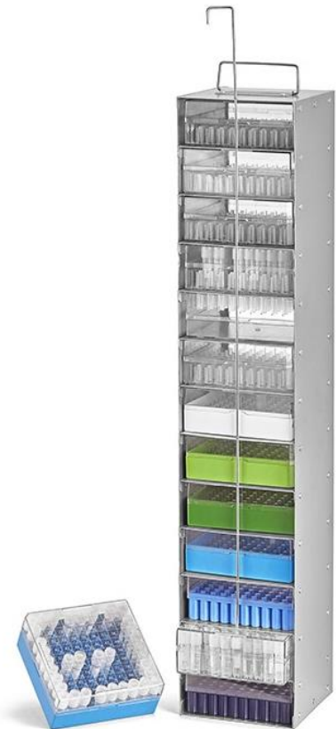
Vertical Racks for Cryoboxes