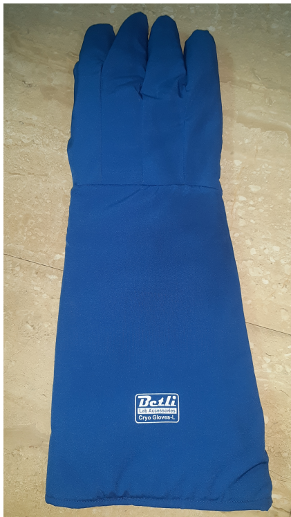
CRYO Gloves (Size Elbow)

We can also supply the following items:-