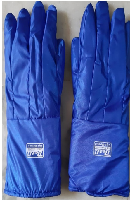
Cryo Gloves (Size Mid Arm)