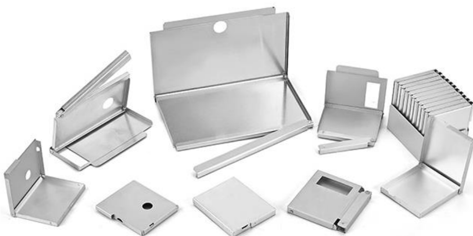
Canisters sizing from 25 ml. to 750 ml.