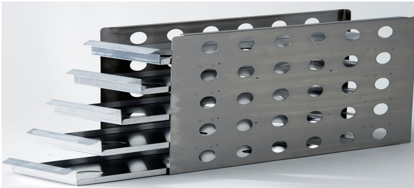
Drawer Type Aluminum Sliding Racks for Cryoboxes or Microplates