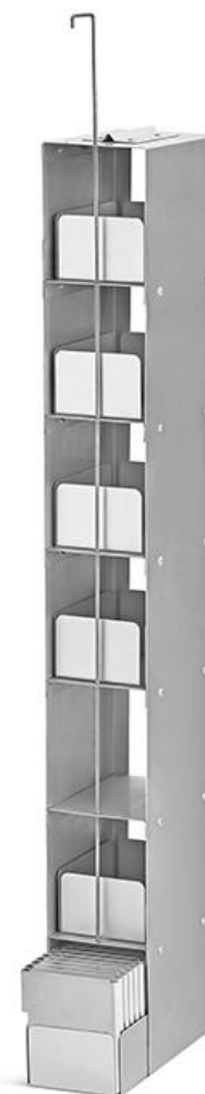
Cryo Tower for Canisters