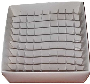
Card Board Cryobox for 2ml. vials