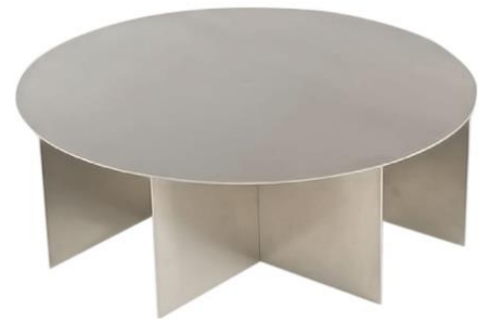
VAPOR PLATFORM RISER FOR LIQUID PHASE SYSTEMS

We can also supply the following items:-