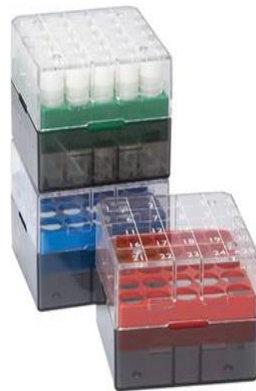
5x5 PC Cryobox