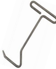
RACK LIFTING TOOL