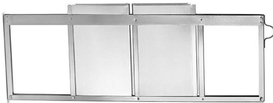
Frame for 500 ml. Canister