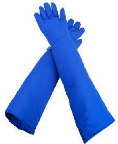
CRYO Gloves (Size Elbow)