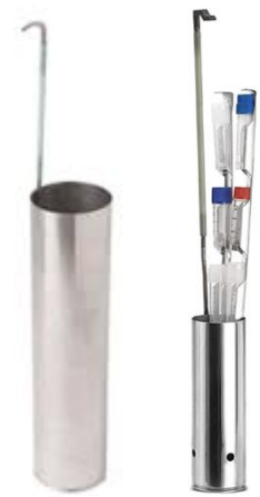
Round Canisters for Canes