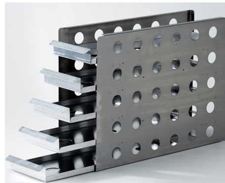
SS Cryo Rack