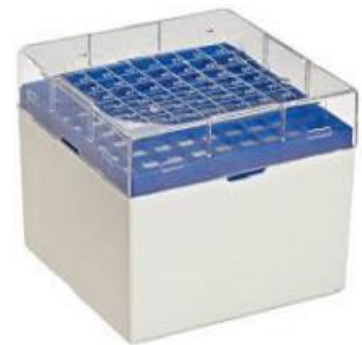
PC Cryobox for 4.5ml. vials